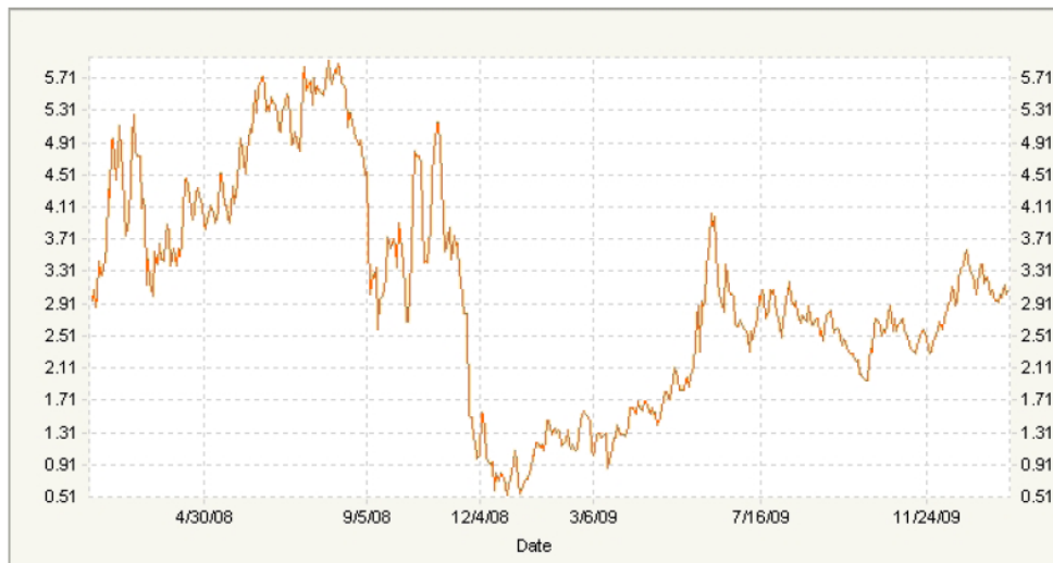
FN 6 price minus FN 5 price

Now one could argue that such Government interference in the private Capital Markets would be disruptive. Moreover, some have insisted that a Government manipulated ReFinance wave would ruin the MBS market and that buyers would never return for fear of other capricious activity. Well, what exactly do you call what we have now ?